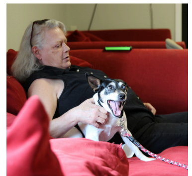
Moo Moo can't believe her good fortune - there are COUCHES!