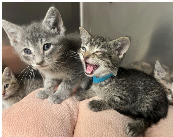
Found in Felicity as strays, these twelve kittens came in with severe eye infections; heart malformations; and pneumonia. They will be in care for several weeks, and cost well over $2,000 in medical care.