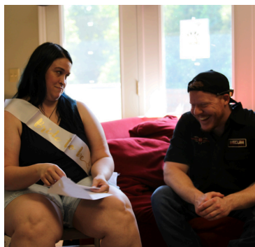
The bride and groom open presents.