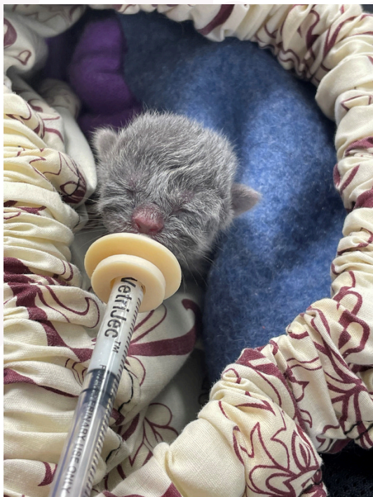
Just two days old, Smokey was found outside, alone - and will require round-the-clock bottle feeding for 4-5 weeks. .

It sounds cute - “kitten season.” Conjuring up images of frolicking fluffs, meowing plaintively. Who doesn’t love an adorable kitten?