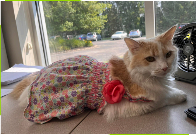
Brave, or ill-advised? League staff regularly dress Chip.

It's not this abortive start that led to Chip's notoriety, of course - it's her spicy personality that has earned Chip her own t-shirt; countless social media posts; her paw print in League cement; and a loyal following among League supporters. As likely to rub up against your leg tenderly as she is to bite you; as likely to seek out affection as she is to run at you aggressively with murder on her mind, Chip has kept League staff, volunteers, and the poor unwitting public on their toes for two years with a singular charisma that is cat-ness at its finest. Did we mention she also hates other cats?