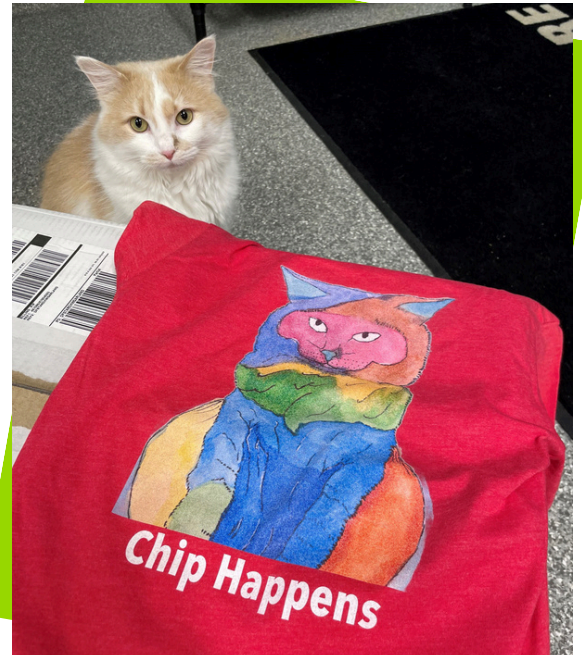
Chip earned her own t-shirt - a first in League history.

So who is the perfect family for this spirited fluff?