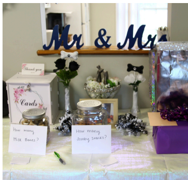
Dog-themed decor, games, and food were a highlight of the day.

Interested in planning a special celebration at the League? Contact us at info@lfaw.org for more information!